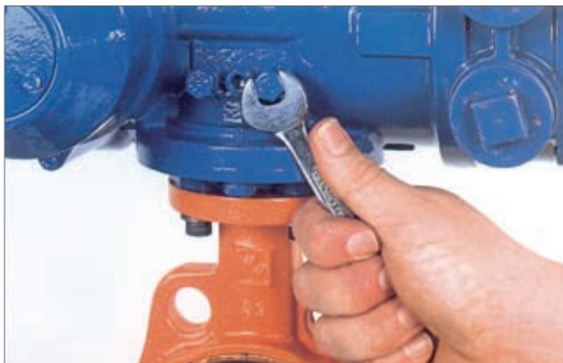
Mechanical stop adjustment

A handwheel is provided for manual operation, which is engaged by a padlockable hand/auto selection lever arranged for power preference. When engaged, the handwheel drives the second wormshaft. At no time can the handwheel be driven by the motor.