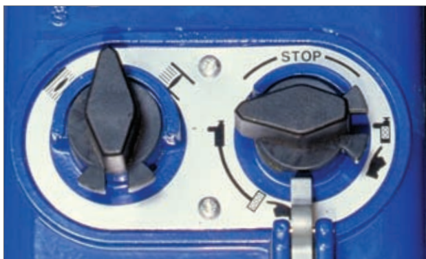
Local control selectors

The gearcase and all housings are diecast aluminium to BS1490. The main gearcase and motor housings are to grade LM4 with the remainder being LM24.