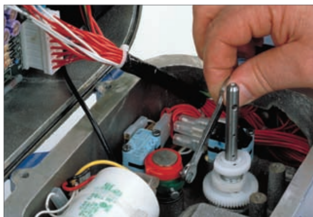
Torque switch setting