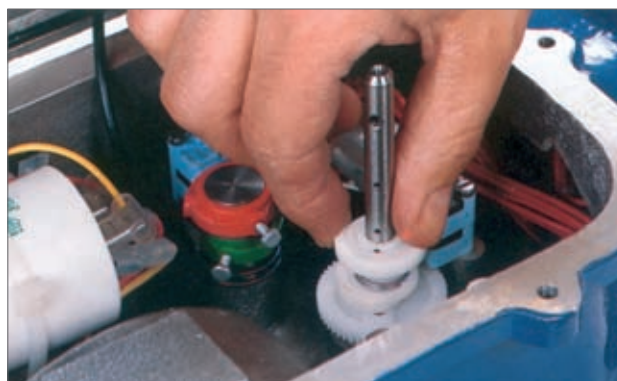
Auxilliary limit switch setting

One each for open and close ends of travel with normally closed contacts. Torque measurement is derived from the self locking output worm and wheel gearing, which avoids torque switch reset on the de-energization of the motor and its associated 'hammering' phenomenon.