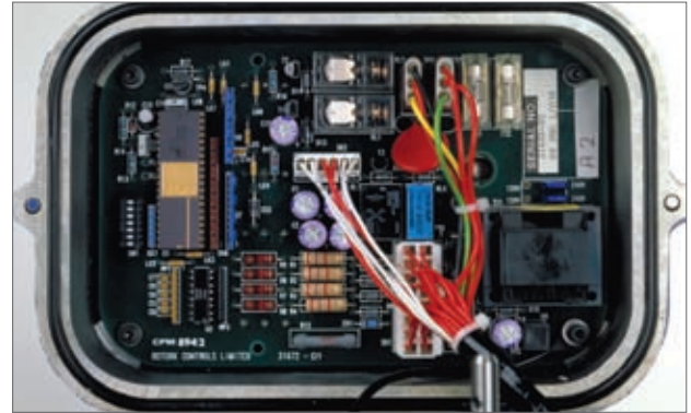
Control interface module

The Q-pak comprises all the features of the Q-standard, as described above, with the addition of the control interface module.