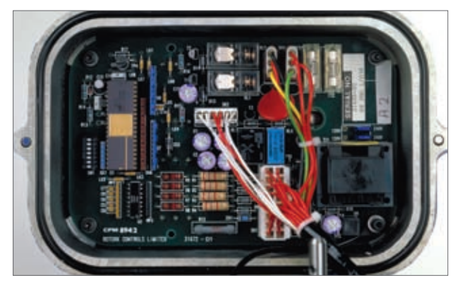
Control interface module

The Q-pak comprises all the features of the Q-standard, as described above, with the addition of the control interface module.