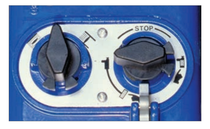
Local control selectors

The gearcase and all housings are diecast aluminium to BS1490. The main gearcase and motor housings are to grade LM4 with the remainder being LM24.